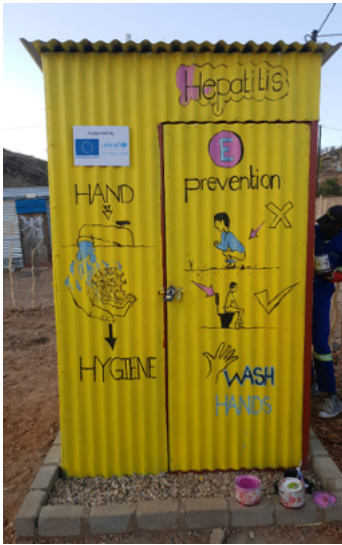
Toilet Contruction (left) The new toilet is then painted with messaging about the danger of open defecation (right)