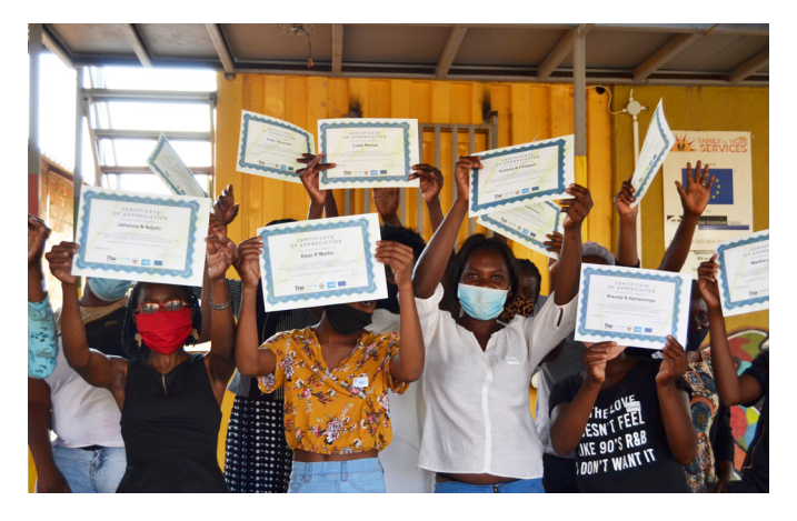
ECD teachers who successfully completed a training have received a certificate of attendance.

Trainings have now been provided to a total of 415 teachers in Windhoek, Katima Mulilo, Opuwo, Oshakati, Omaruru and Opuwo. The training has been delivered by private sector ECD practitioners with a wealth of knowledge and experience within the field of ECD. Training content includes holistic child development, learning through play, planning and assessment, parental support and classroom management.