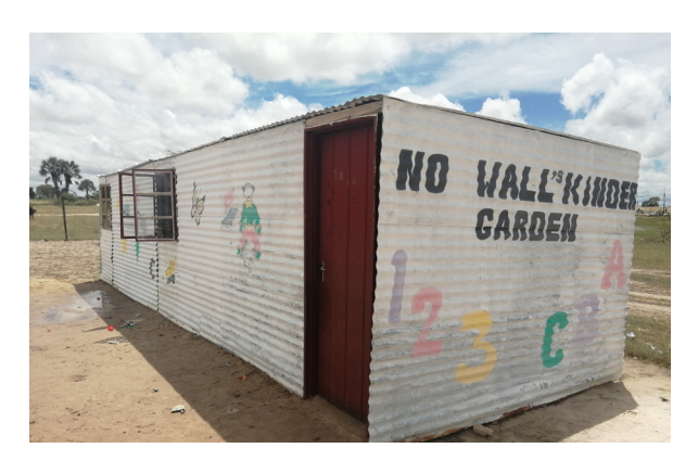
ECD centre in Oshakati

DWN works in close collaboration with the Ministry of Gender Equality, Poverty Eradication and Social Welfare (MGEPESW) and Ministry of Education, Arts and Culture (MoEAC). In alignment with government policies, DWN is in the process of developing a sustainable support network for ECD centres in disadvantaged communities.