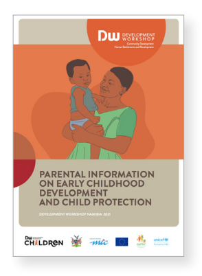
Parental information booklet: 5,000 copies