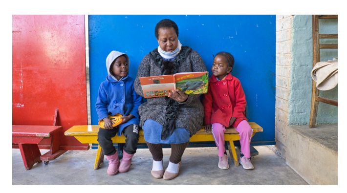
An educarer engaged with children while reading a story to them