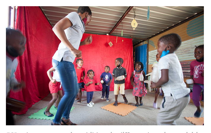
ECD educarer engaging children in different learning activities