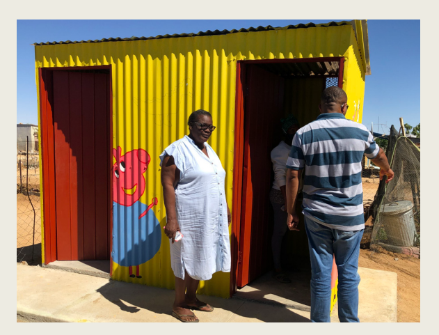
An official from the Ministry of Gender inspecting newly built toilets