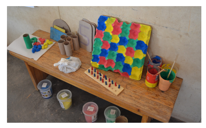
Resources made with some of the stationary items provided by the programme