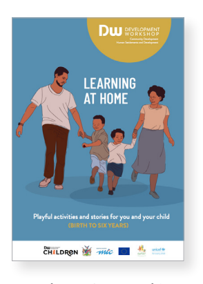
Learning at home guide: 5,000 copies