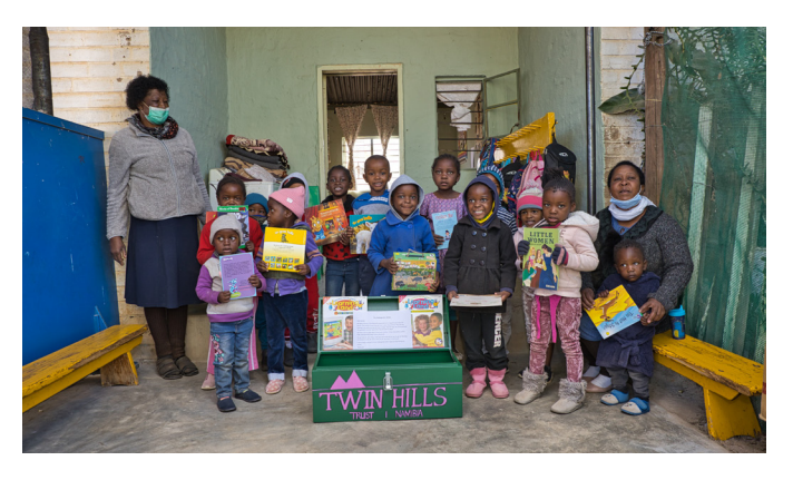
ECD centre library box hand over in Omaruru: A total of 4 library boxes were distributed in Omaruru and 2 in Bethanie (Karas Region)