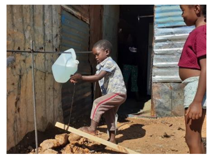
A young Tippy Tap user demonstrates how to use it

We are starting to scale up the project to towns in other regions of Namibia. Thus far, we have held meetings with the relevant government and traditional authorities in Otjiwarongo, Otavi, Kalkveld and Omatjete. With support from B2Gold, the DWN/NCE programme will initiate construction of a minimum of 5,000 tippy taps on Tuesday 28 April in informal settlements in these locations.