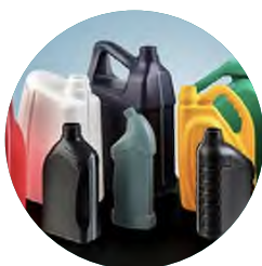
Petrol and oil containers