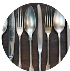
Metal spoons, knives and forks