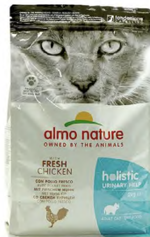
Pet food bags (without foil)