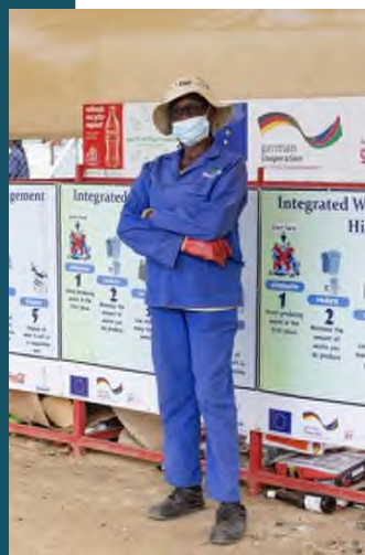
Recycler in Hadino Nghishongwa wearing proper protective clothing for recycling