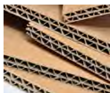
Cardboard Medium (squiggly middle part)