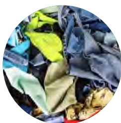
Old clothing and fabric