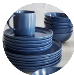
Ceramic bowls, plates and cups