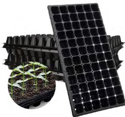
Plastic seedling trays

If you have a Rent-A-Drum outlet in your town, you can include these items in your recycling bin: Pet food bags, without foil. Plastic seedling trays.