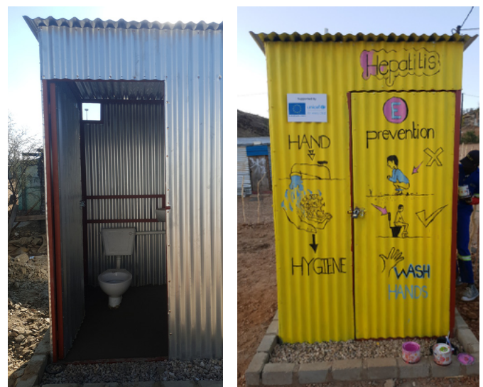
Toilet Construction (left) The new toilet is then painted with messaging about the danger of open defecation (right)

During July, DWN conducted a detailed physical structure assessments of all ECD centres in Windhoek supported by this project. Results showed that 32 centres have unsafe or no toilets. 15 ECD centres were then selected for the construction of toilets.