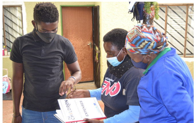
DWN staff member revising the bookkeeping records at an ECD centre