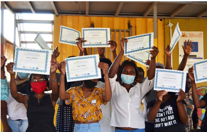
ECD teachers who successfully completed a training have received a certificate of attendance.

Trainings have now been provided to a total of 415 teachers in Windhoek, Katima Mulilo, Opuwo, Oshakati, Omaruru and Opuwo. The training has been delivered by private sector ECD practitioners with a wealth of knowledge and experience within the field of ECD. Training content includes holistic child development, learning through play, planning and assessment, parental support and classroom management.