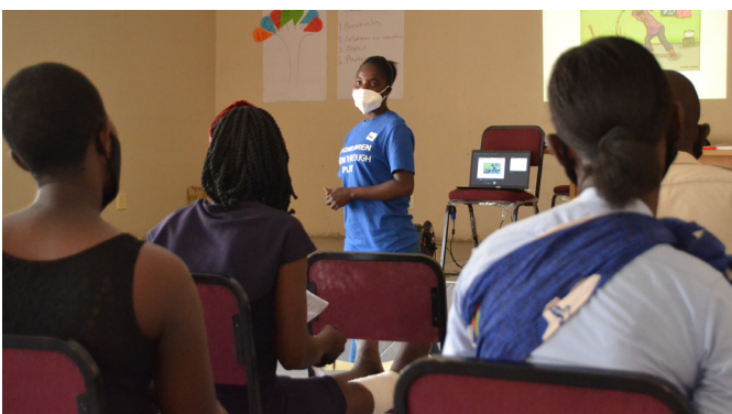
ECD teacher training