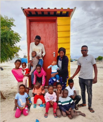
A new toilet at an ECD centre in Oniipa