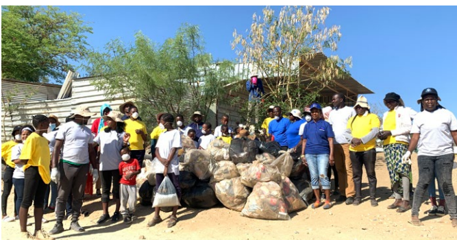
Clean up campaign

Six members of the German Parliament visited the project on 1st October 2022 in Windhoek's Hadino Hishongwa informal settlement. The parliamentarians had the opportunity to talk to project volunteers and local residents in the informal settlement and to get a better understanding of the sanitation challenges in this area.