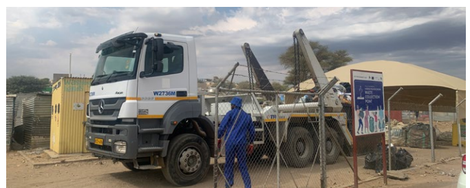
City of Windhoek truck at the project's waste collection point, picking up collected waste