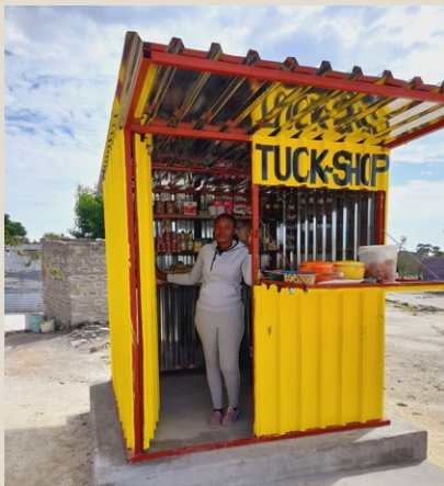
Business stall by the waste collection point in Oniipa