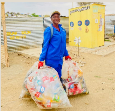
Recycling in informal settlements