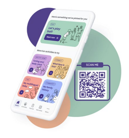
Scan this QR code to download the Thrive-by-5App.

The roadshows visited six towns in three regions: Swakopmund and Omatjete in Erongo, Opuwo and Sesfontein in Kunene, and Otjiwarongo and Tsumkwe in Ot-