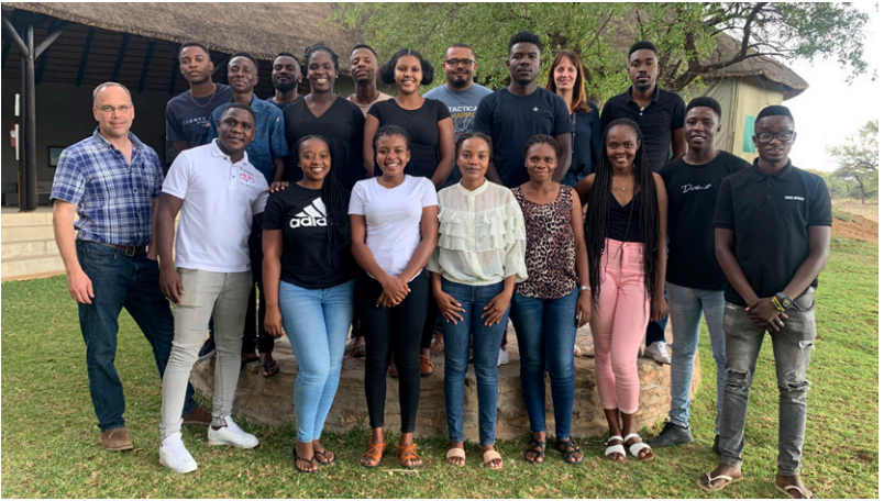
Team in Namibia