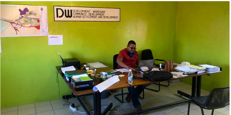
DW field office in Karibib, central Namibia.